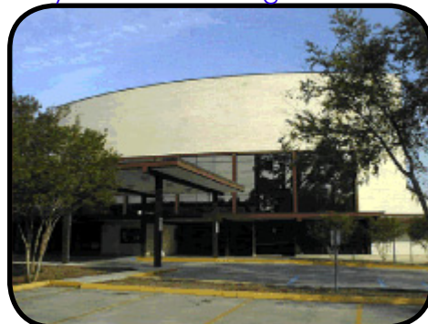
Heymann Performing Arts Center

The Hilton Lafayette has been contracted by the government to house evacuees and relief workers indefinitely. It took effort and compassion from the wonderful people at the brand new Hilton Garden Inn to secure us a new home. Our new address is 2350 W. Congress St., Lafayette, LA 70506. Parents, family and friends are invited to reserve rooms by calling 1-877-STAYHGI (782-3444) after November 20. To secure a reduced rate, please mention your affiliation with the pageants. Additional discounted rooms will be available at the Hotel Acadiana, 1801 W. Pinhook Rd., Lafayette, LA 70508, (337) 233-8120.