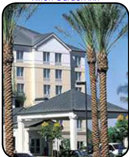
Hilton Garden Inn

The Heymann Performing Arts Center will continue to serve as the pageant's theater. Ticket orders already submitted to the Heymann will be filled in the order in which they were received. Tickets already purchased through Ticketmaster will be honored with no changes necessary. If you have not yet reserved your seats, please complete an updated ticket order form available at http://www.misslouisianausa.com/LATicketOrderForm.pdf . You may also place your order through Ticketmaster by calling your local charge-by-phone number or visiting http://www.ticketmaster.com . Tickets purchased through Ticketmaster will incur additional charges.